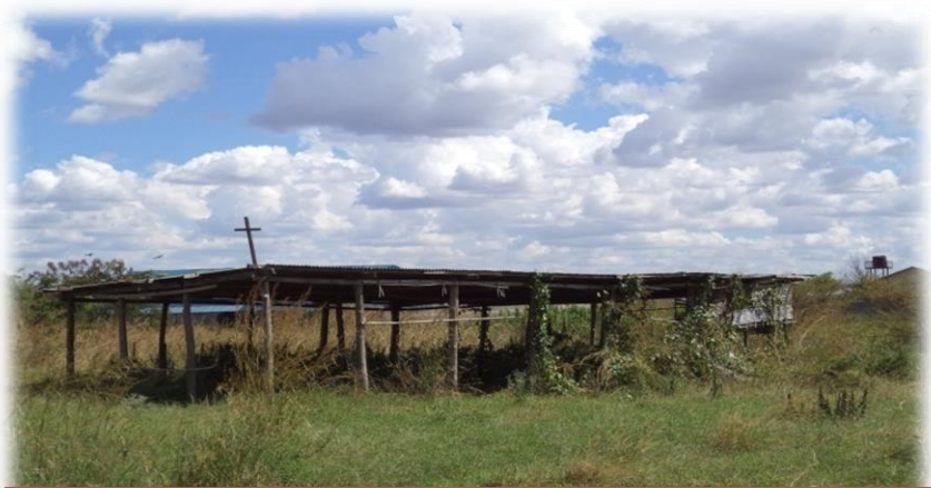
JSRC worship center destroyed during 2013 crisis in Juba