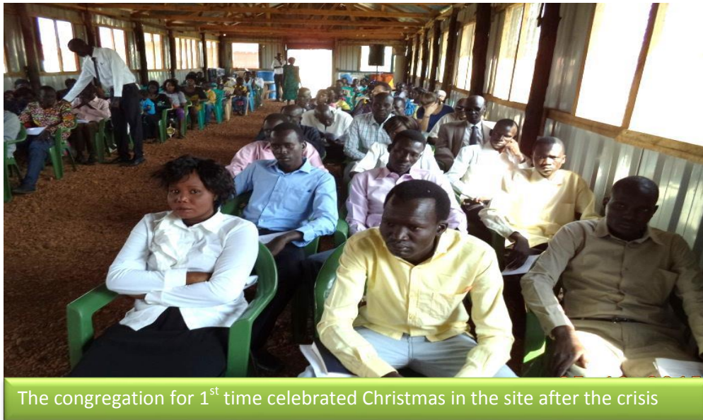
The congregation for 1 st time celebrated Christmas in the site after the crisis

Due to instability in the country, JSRC is becoming a key congregation of SRC replacing Immanuel Sudanese Reformed Church in Malakal which used to be the leading congregation before late 2013. All SRC resources are now being focused on Juba which is hoped to be SRC hub.