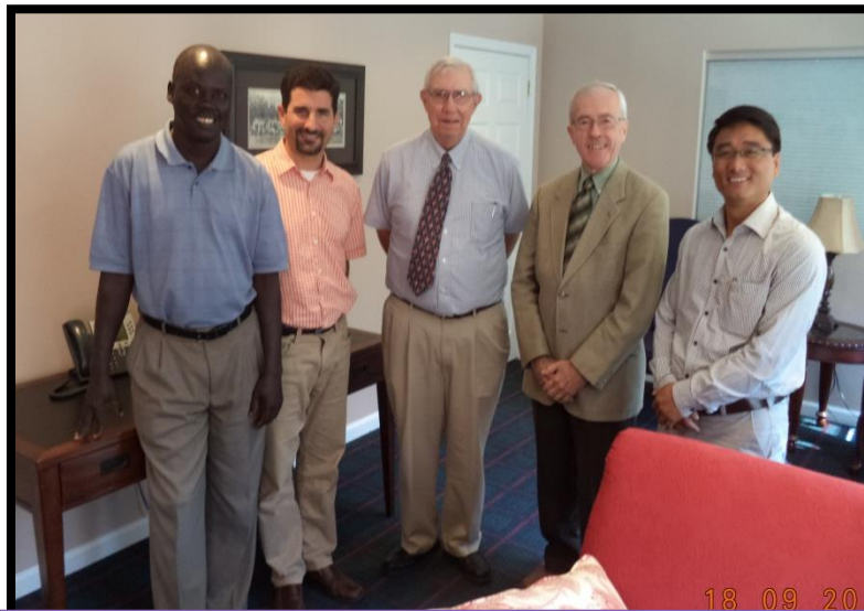
Some of OPC leaders with representatives from Sudan and North East India during ICRC WMC meeting

SRC participated in ICRC Missions Committee consultation which was held in September 16-17, 2015 at Orthodox Presbyterian Church Headquarters, Willow Grove, Pennsylvania. It was a