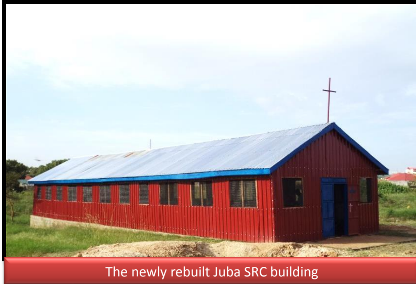
The newly rebuilt Juba SRC building

all these situations, JSRC is prompted by Christ's love to build trust and confidence among the people of South Sudan through the ministry of the gospel.